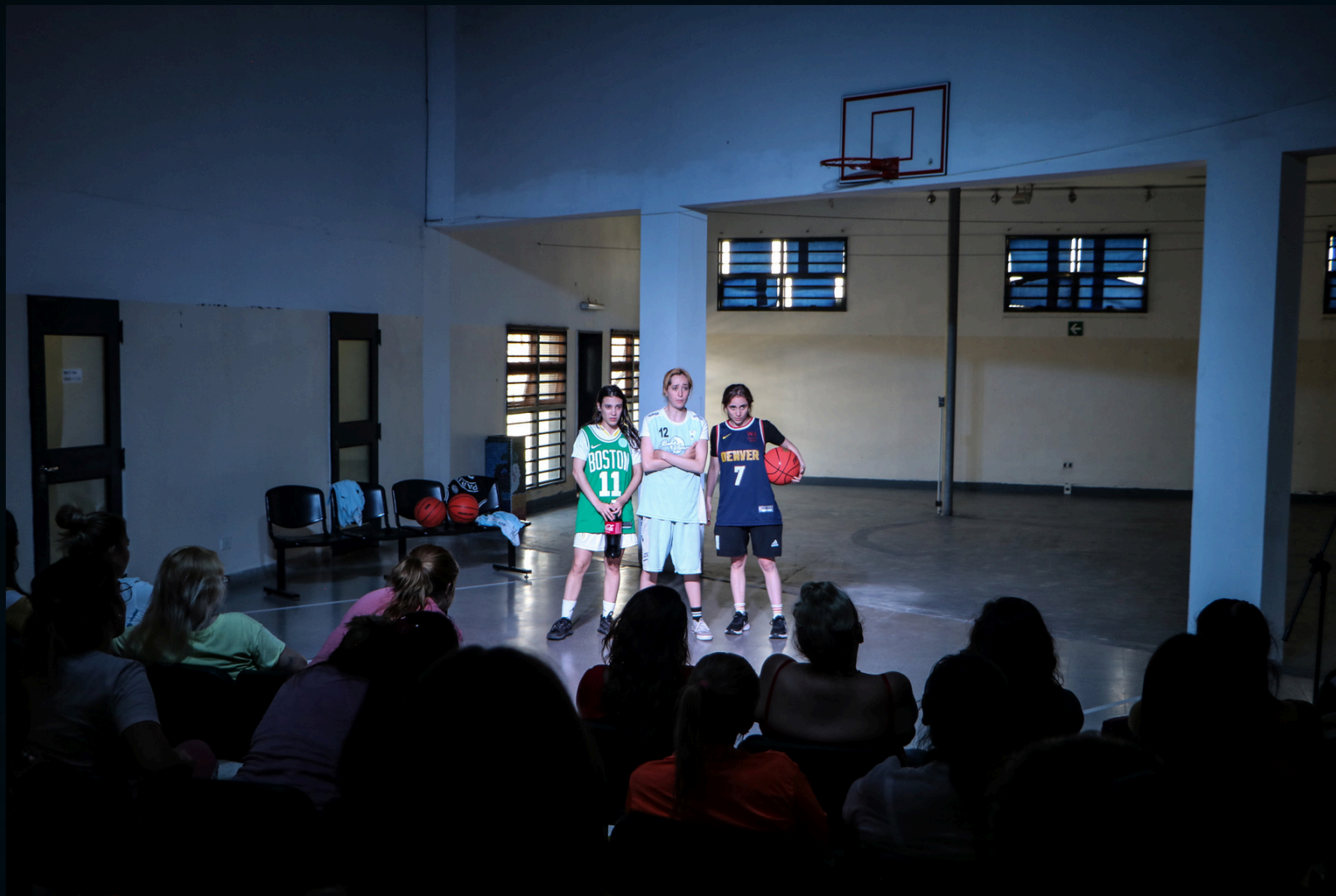
FESTIVAL DE TEATRO EN LA CÁRCEL, WOMEN'S AND TRANS WOMEN'S PRISON, EZEIZA, ARGENTINA