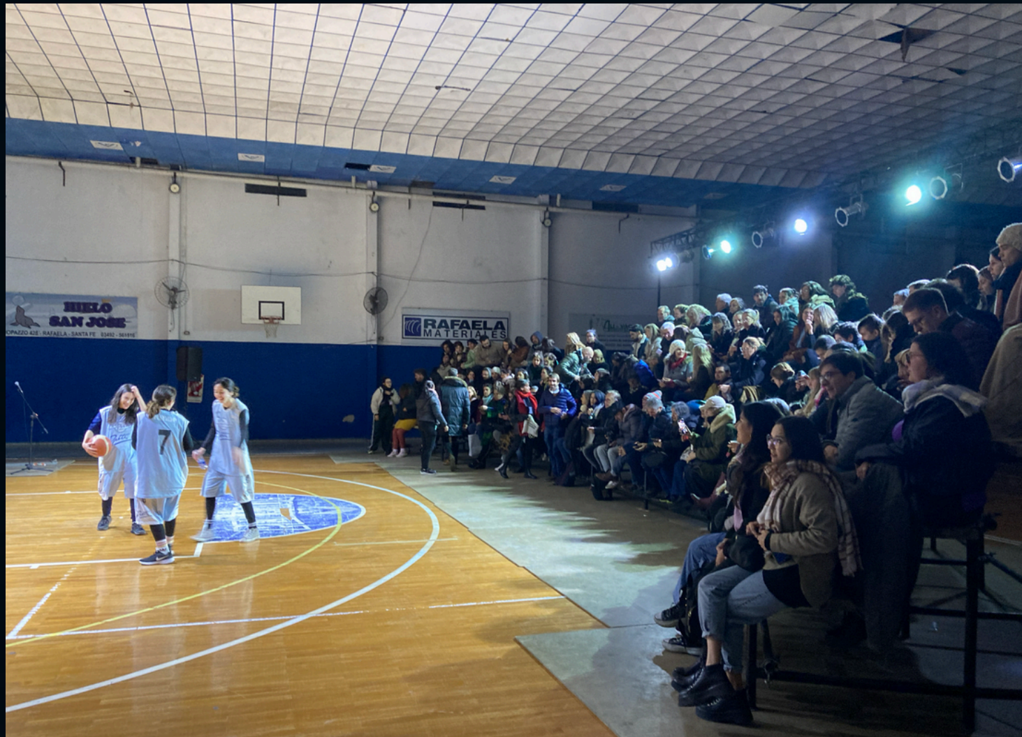
FESTIVAL DE TEATRO DE RAFAELA (BASKETBALL COURT), SANTA FE, ARGENTINA