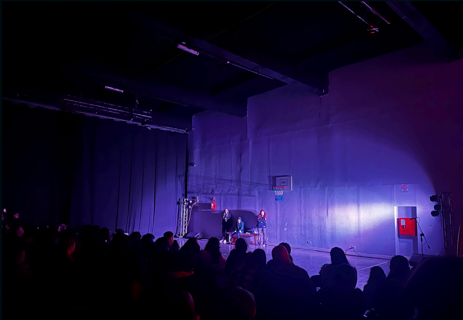
CIUDAD CULTURAL KONEX, BUENOS AIRES, ARGENTINA