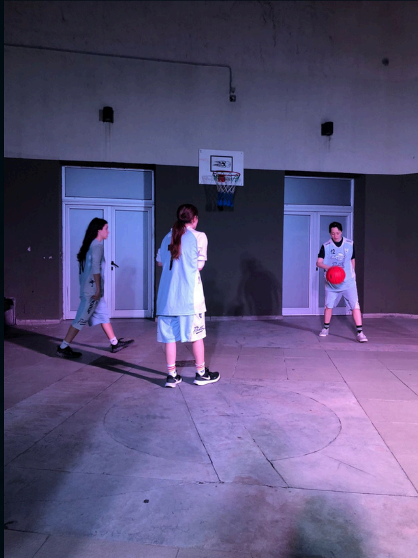
LA CASA DEL BICENTENARIO (OUTDOORS), BUENOS AIRES